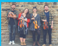
English Fiddle Ensemble